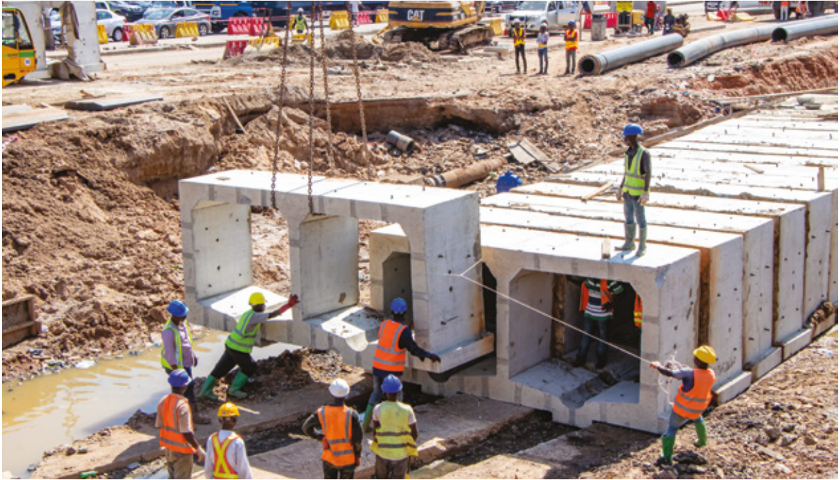
One of the drainage systems reconstructed in Accra