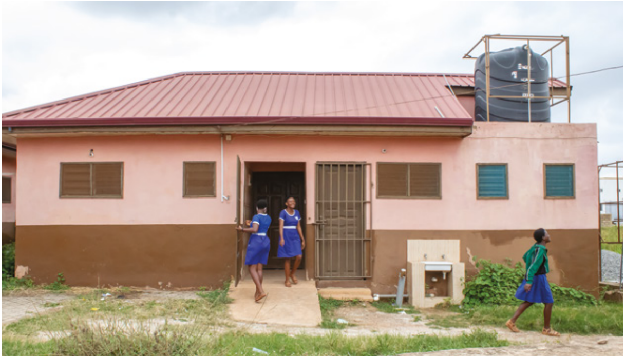
One of the numerous institutional (school) toilet facilities