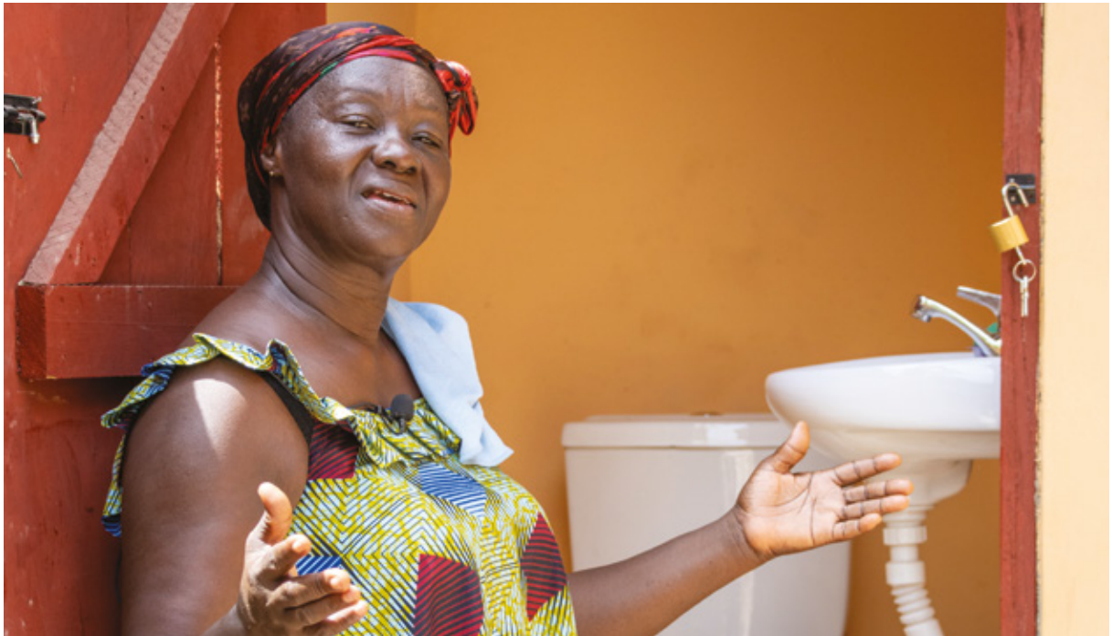
An excited household toilet beneficiary