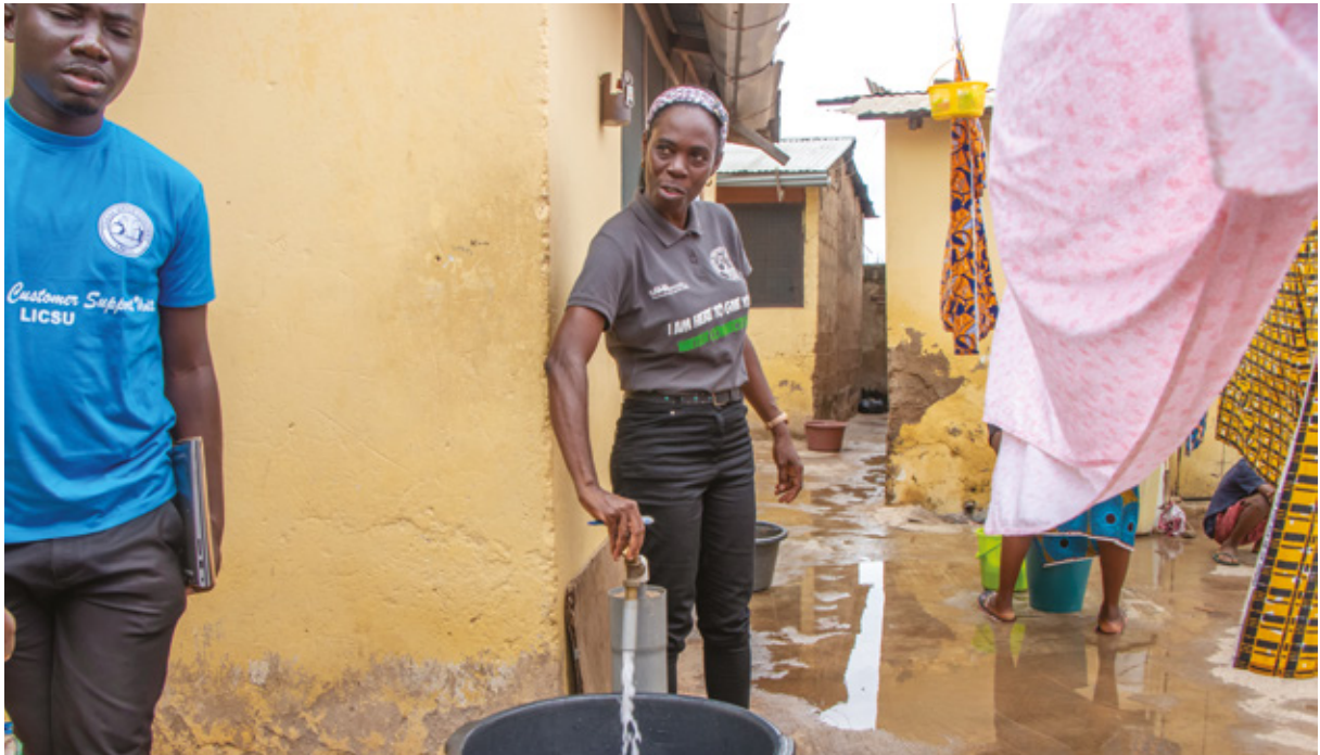
Staff of GWCL LICSU inspecting a new water connection in Accra